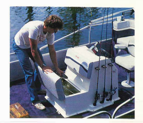
you need for your family and friends.

For 1987, Starcraft is booming into the pontoon/ fishing market with the same results. Folks buy 'em just as fast as we can make 'em.