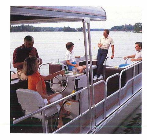
The SD 200 is the cruising version of our 20' pontoon series. It features our 8' aluminum canopy and can be equipped with as much luxury

This year, Starcraft added a huge 28-footer, with a 216square foot deck. With the optional refreshment center, you can entertain a large party of friends.