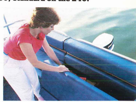
The cushions on the rear sofa reveal large hidden storage areas.