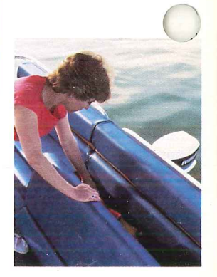
The optional rear sofa gives you extra seating and more built-in storage.