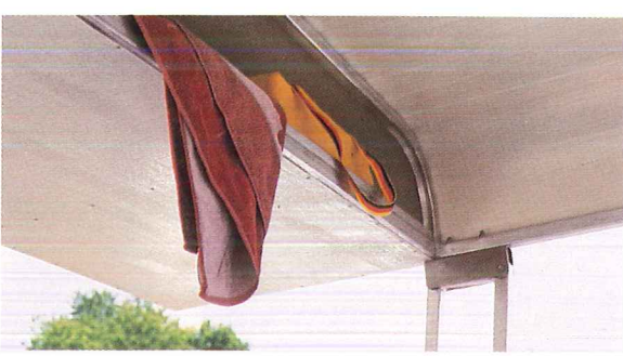
The new StarDeck pontoon boats are built with lots of standard features. The SD 200 has an upholstered console with a courtesy light and a lockable glove box, a carpeted ¾" plywood deck, and a stainless steel steering wheel. The canopy has a roomy built-in storage shelf.

Swim from it, fish from it, have a barbeque on it... The SD 200 is versatile enough for almost any onwater activity.