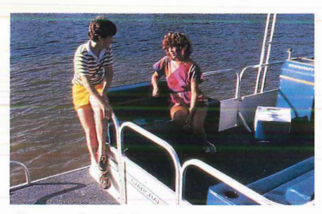
The optional front sofas give you additional seating and storage.