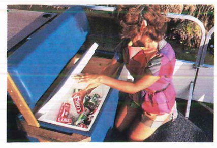
The SD 240 dinette also features a built-in ice chest.