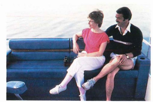
A full width rear sofa is optional on the SD 200, standard on the 240.