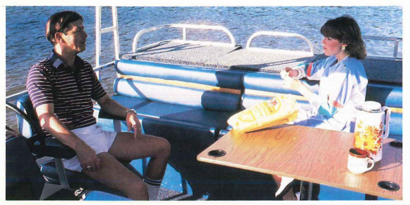
A dinette with reversible seating is available on the StarDeck 240.