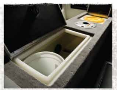
»Livewell with Oxygenator