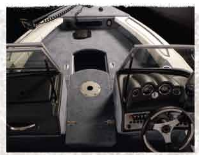
>> Convertible Walk-Thru