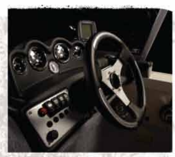
» Driver's Console Shown with optional graph.