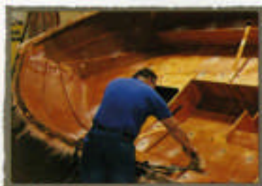
THE INTEGRATED STRINGER SYSTEM PROVIDES CONSISTENT STRENGTH. STRINGERS ARE LAMINATED TO THE HULL TO INCREASE STRENGTH AND ELIMINATE WATER INTRUSION.

because we use only the latest technology