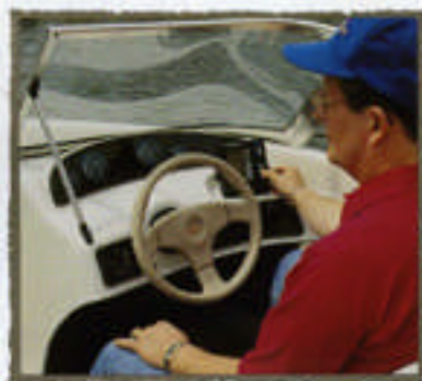
THE CONSOLE FEATURES ALL QUICKSILVER® INSTRUMENTS.