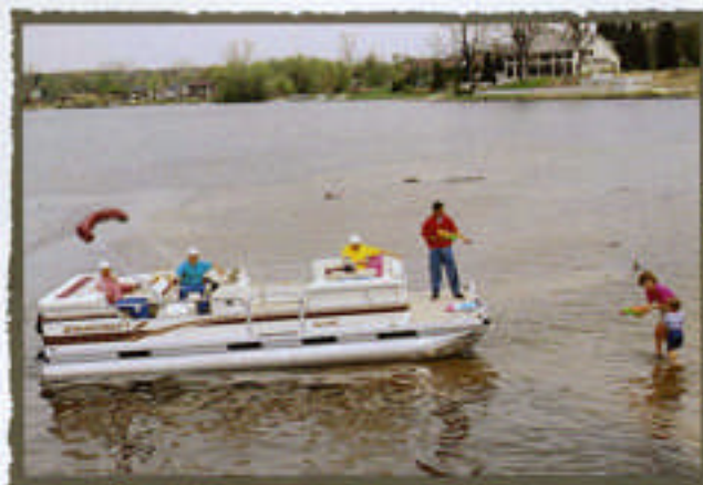
STARDECK 240 CLASSIC

You'll find more than sufficient storage space in the Stardeck Series, storage is located in the fore and aft seats and in the console.