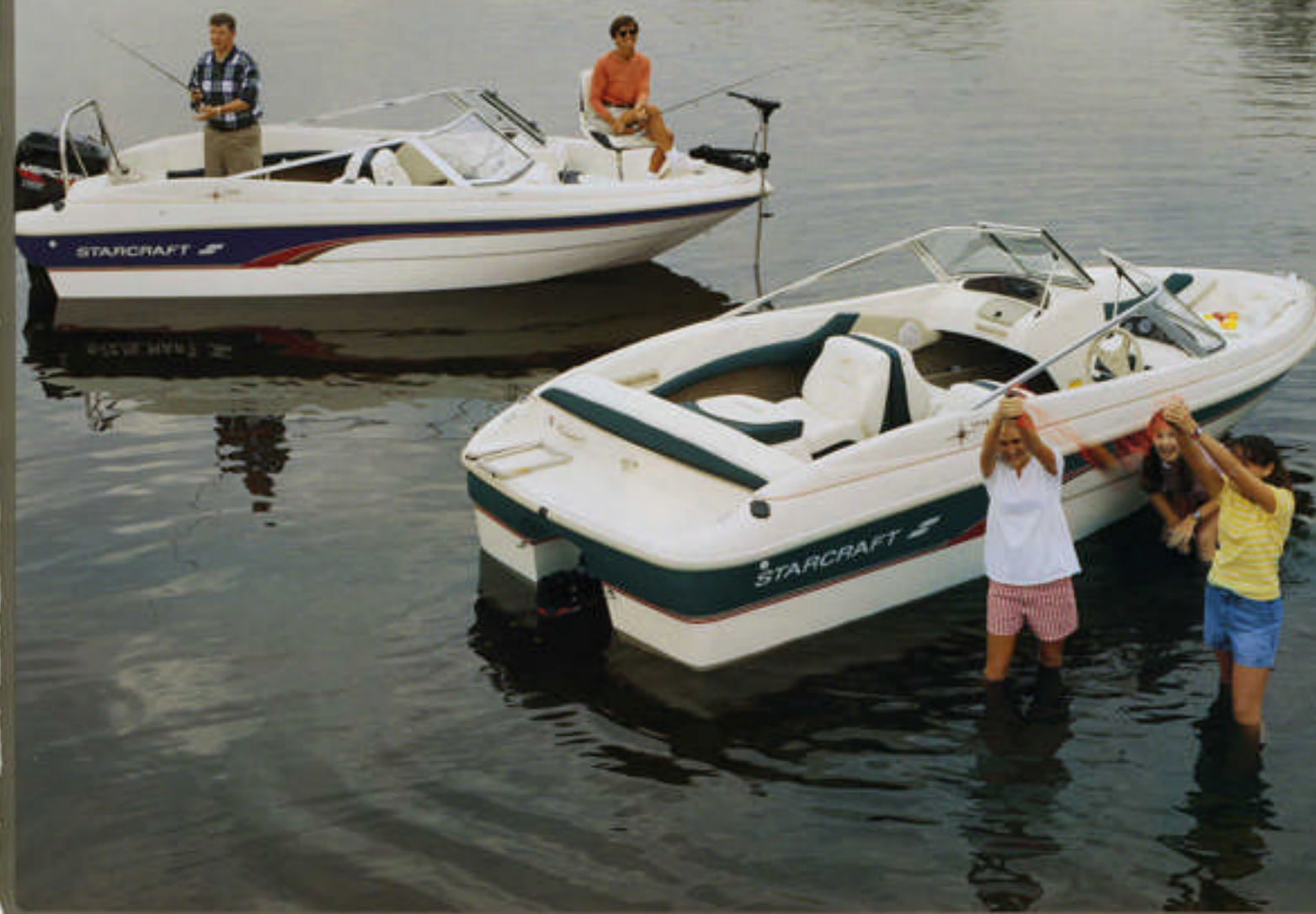
1709 and 1710