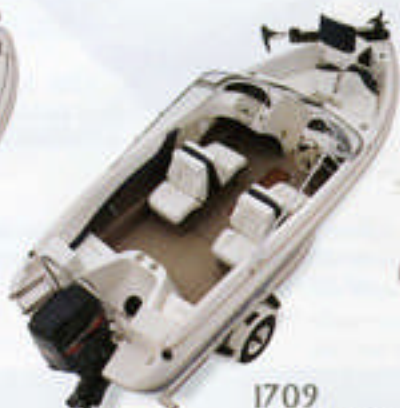
1709 Fish & Ski