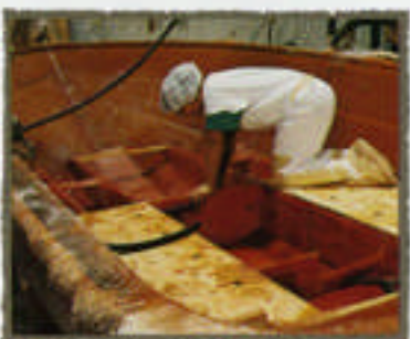
THE FLOOR SYSTEM, MADE OF 7-PLY 3/4" MARINE GRADE PLYWOOD, IS ENCAPSULATED IN FIBERGLASS RESIN, SCREEMED AND LAMINATED, PREVENTING WATER INTRUSION.