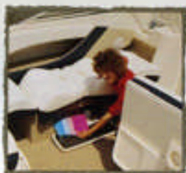
THE FOLD-DOWN TABLE BEHIND THE CAPTAIN'S CHAIR COMES COMPLETE WITH DRINK HOLDERS.

Quicksilver® instrumentation, 51 gallon fuel tank and fine craftsmanship will assure you the best performance and utmost comfort for all of your trips.