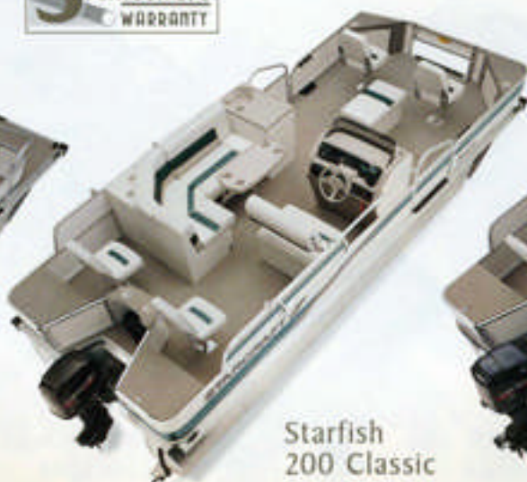
Starfish 200 Classic