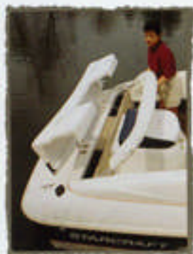
THE CONVERTIBLE TOP IS EASY TO SET-UP OR STORE.

B ring your own tunes or listen to your favorite station on the built-in AM/FM stereo cassette player. Kick back in the shade of the canvas top which, when not in use, tucks away neatly in its hidden top storage.