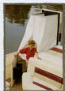
CLASSIC & ELITE STARDECKS FEATURE A POP-UP CHANGING ROOM WITH A PORTA Potty®

moving around. Enjoy your day's catch by using the Stardeck's grill.