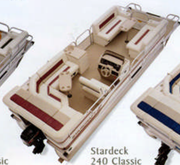
Stardeck 240 Classic