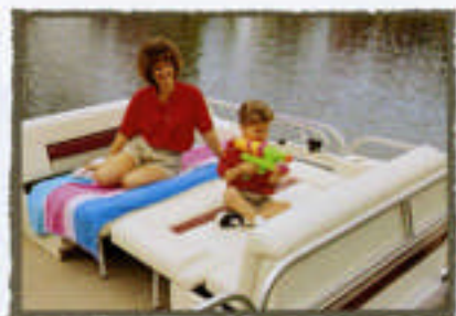
THE STARDECK 240 AND 241 CLASSIC INCLUDE FORE SOFA SEATS WHICH ALSO SERVE AS SLEEPER SEATS, CONVERTING TO A PADDED SANDCOT.

equipped with a refrigerator, single stove burner, cutting board and sink with fresh water pump. It's even possible to store and hook-up a microwave! A double vinyl rub rail on the