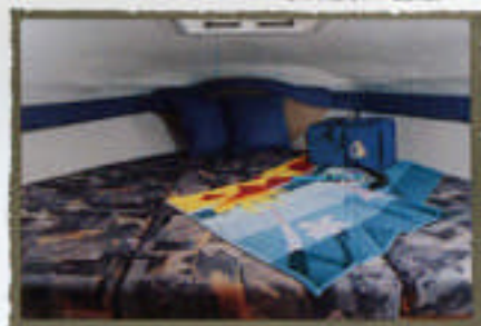
IN THE BOW CABIN OF THE 2212 THERE IS A COMFORTABLE V-BERTH, WITH A FRESH AIR HATCH.

Quicksilver® instrumentation, 51 gallon fuel tank and fine craftsmanship will assure you the best performance and utmost comfort for all of your trips.