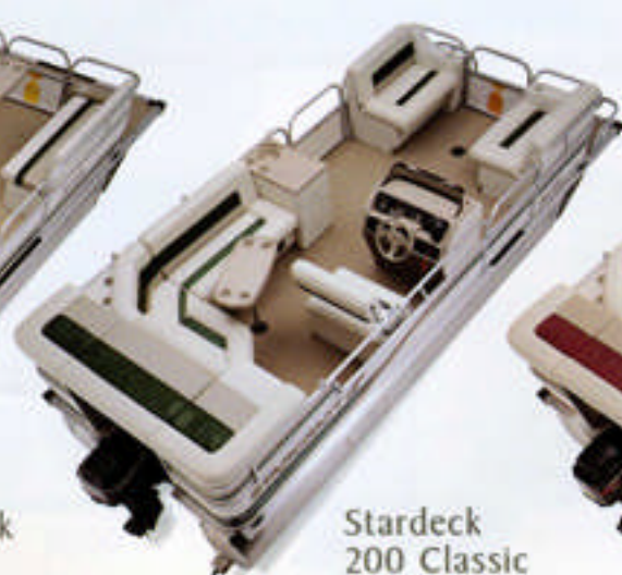
Stardeck 200 Classic