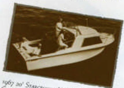
1967 20' Starcruiser-V.I.O. Fiberglass Cruiser — 130 H.P. Engine

AN ENTERTAINMENT CENTER BEHIND THE HELM SEAT PROVIDES AN ELEGANT SETTING FOR A WELL-DESERVED TONST.