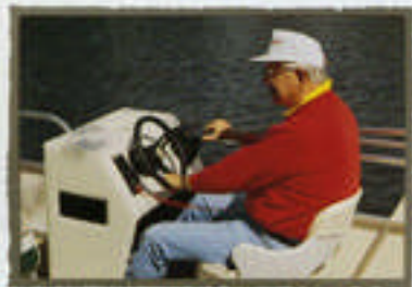
COMMAND YOUR STARFISH FROM THE CONSOLE THAT INCLUDES ALL QUICKSILVER® INSTRUMENTATION.

For family and friends who would rather cruise than fish, the Starfish features plush upholstered seating, beverage holders and a dinette table. On the Starfish 200 Classic and Elite pontoons, there's even a changing room. Additional amenities include an AM/FM stereo cassette and a stow-away boarding ladder. All three models have a rain and sun resistant bimini top.