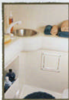
THE LARGE, ENCLOSED HEAD FEATURES A SINK, HAND-HELD SHOWER, STORAGE SPACE AND A PUMP-OUT HEAD.

2513 Cruiser. Cruise for a day or a weekend.