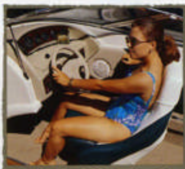
THE CONSOLE FEATURES ALL QUICKSILVER® INSTRUMENTS, A TILT SPORT STEERING WHEEL, LOCKABLE STORAGE, PLUS AN AM/FM CASSETTE PLAYER.

With five models to choose from, each comes with a matching custom Starcraft trailer. There's bound to be one that suits your style.