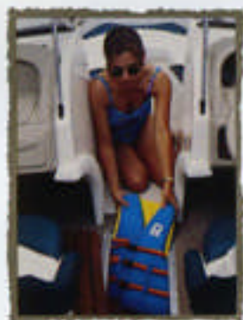
THERE'S PLENTY OF IN-FLOOR STORAGE FOR SKIS.