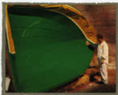
THE 20-24 MIL LAYER OF HIGH QUALITY I.S.O. ORTHO N.P.C. GEL COAT IS USED TO PREVENT CRACKING, CRAZING AND PROVIDE UV STABILITY TO PREVENT FADING.

At Starcraft, we've been building boats for 94 years. And, those 94 years of