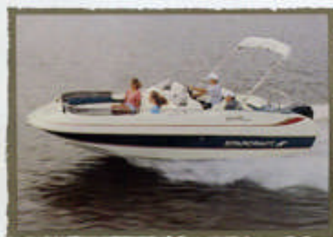
The Starship 2005 ... FUN ... FAST ... SMOOTH.

and T-shaped aft conversation area, the Starship 2000 can accommodate a multitude of activities. You'll find plenty of storage space under seats as well as a large in-floor storage area,