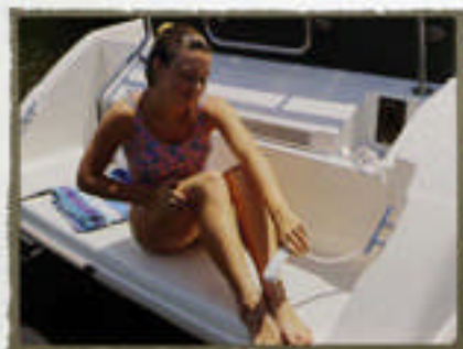
A HAND-HELD SHOWER ON THE AFT PLATFORM FACILITATES SWIMMERS COMING ABOARD.

On the outside, you'll find a walk-around deck, as well as a large