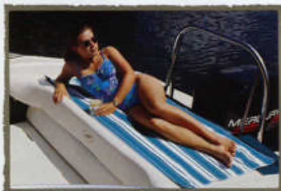
THE 1800SS FEATURES A SPACIOUS AFT SUN PAD.

Eurostyle bench seat which adds to the comfort found in Starcraft boats.