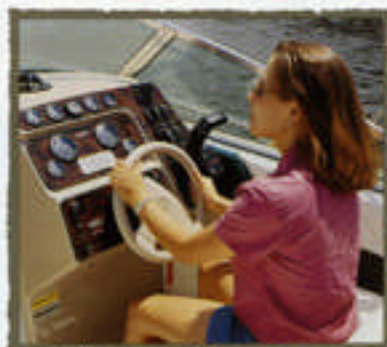
THE COMMAND HELM IS HOME TO A COMPASS, TACHOMETER, SPEEDOMETER, VOLTMETER, OIL, TEMPERATURE AND FUEL GAUGES, PLUS AN HOUR METER, DIGITAL DEPTH FINDER AND TRIM TABS.

swimming platform with a hand-held shower. There's also plenty of room to sit, a contoured passenger lounge and a wide transom seat. Below are all the comforts of your kitchen including a refrigerator, alcohol/electric stove, stainless steel sink with hot