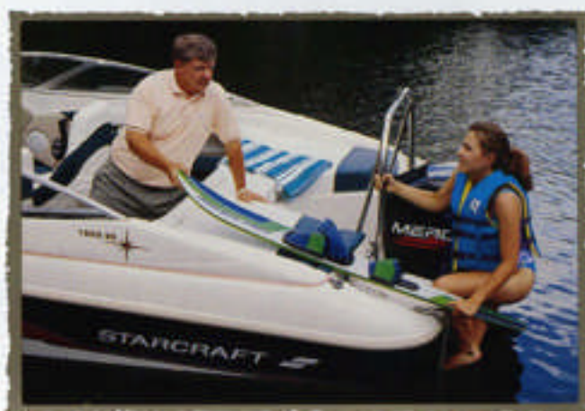
A HANDY STEP LADDER FACILITATES WATERSKIING FUN.