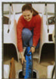
THE RADIUSED WALK-THROUGH WINDSHIELD ALLOWS EASY ACCESS TO THE BOW SEATING AREA, OR TO THE IN-FLOOR STORAGE.