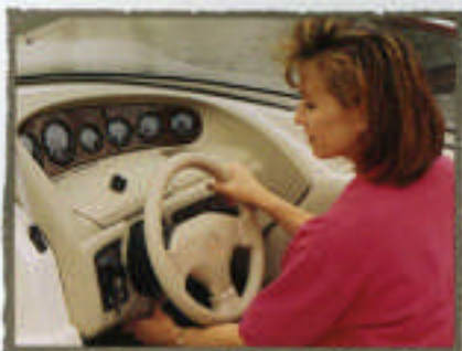
EASY TO REACH CONTROLS AND QUICKSILVER® INSTRUMENTATION KEEPS THE PILOT COMFORTABLY IN CONTROL.