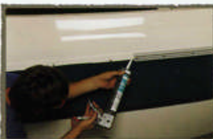
THE HULL AND DECK SEAMS ARE SEALED, THREE-BOLTED AND SCREWED. THEN, A PVC GUNWALE MOLDING IS APPLIED AND SCREWED EVERY 3" FOR A SOLID, SECURE FIT WHICH IMPROVES DECK TO HULL INTEGRITY.

Our seats are ergonomically designed for your comfort. We use high density foam and marine