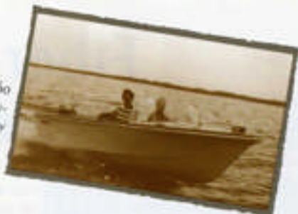
The Rocket, A 1960 14' FIBERGLASS RUN- ABOUT, POWERED BY A 10 TO 40 H.P. OUTBOARD.

Having fun in the sun is easy with the Starcraft 1700 Series! Chock-full of standards, the Starcraft 1700, 1701, 1709 and 1710 fiberglass run-abouts will enhance every boating adventure. Equipped with adjustable seats, an