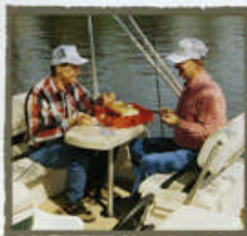
FOR THOSE WHO WOULD RATHER CRUISE THAN FISH, THE STARFISH FEATURES PLUSH UPHOLSTERED SEATING, BEVERAGE HOLDERS AND A DINETTE TABLE.