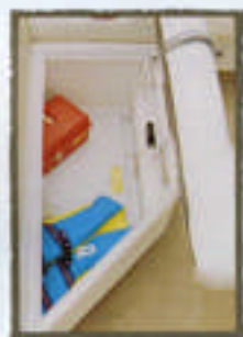
ROTO-CAST® SEAT FRAMES ARE LIGHTWEIGHT AND WILL NOT DEGRADATE FROM THE SUN OR WEATHER.