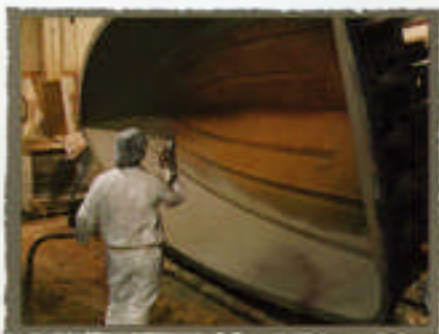
A BARRIER COAT ON THE SIDEWALLS IMPROVES TENSILE STRENGTH OVER Balsa OR COREMAT. IT ALSO ALLOWS MORE STRENGTH AND RIGIDITY WITH LESS WEIGHT AND GIVES MORE FLEX WITHOUT CRACKING GEL COAT.

experience are evident in every one we build. These are the best engineered and best built boats anywhere. We make the transom extra tough with 1-1/2" thick marine grade plywood sandwiched between two layers of fiberglass. The deck also has a unique "lip" design to keep water out. Additional foam and spray-core in the hull sides increase lateral strength. You and your family can trust your Starcraft