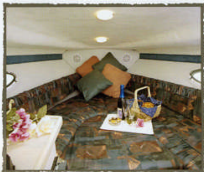
THE FORWARD CABIN INCLUDES A TABLE THAT CONVERTS TO A V-BERTH.

You'll enjoy your stay on the water in comfort and style with the