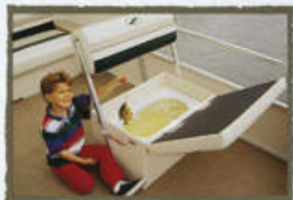
THE TWO-WAY SEAT ON THE 180 IS ALSO HOME TO AN AERATED LIVEWELL.