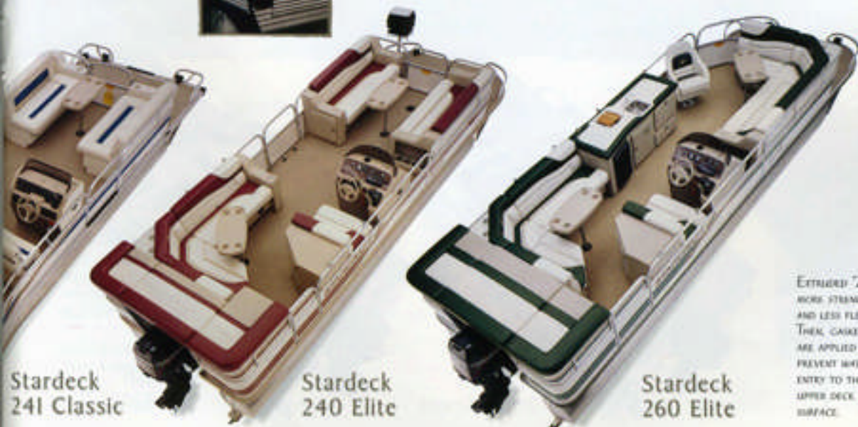
Stardeck 241 Classic