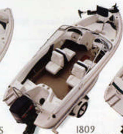
1809 Fish & Ski